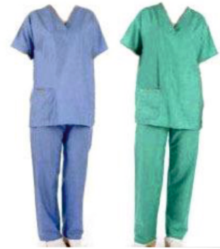
Patient Uniforms Colors, As per requirement Fabric, Cotton, Polyester Pattern, Customized