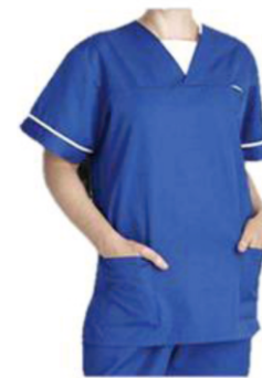
Admin Staff Uniforms Colors, As per requirement Fabric, Cotton, Polyester Pattern, Customized